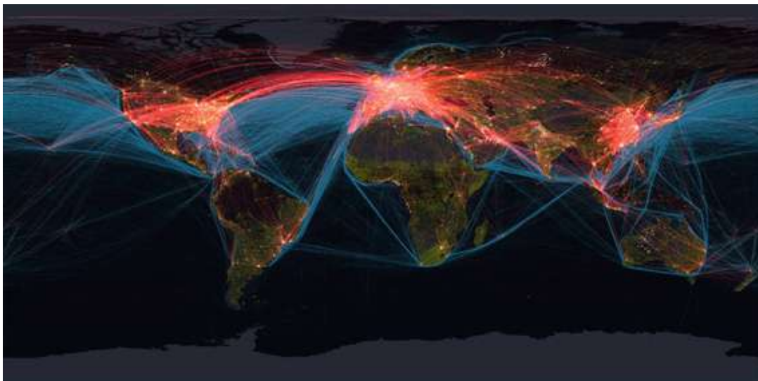
Figure 1: The global transportation system

The evolution of complex logistics systems, the globalization phenomenon, and the pursuit of economic growth of each country result in a huge global distribution network of goods and services, profitable and resourceful, capable of enhancing worldwide progress and improving peoples' lives; see Figure 1. The World Bank (2018) highlights the importance of the sea (see Figure 1 for an impressive view on the overall maritime network with blue lines giving the maritime routes) for logistically well-performing countries.